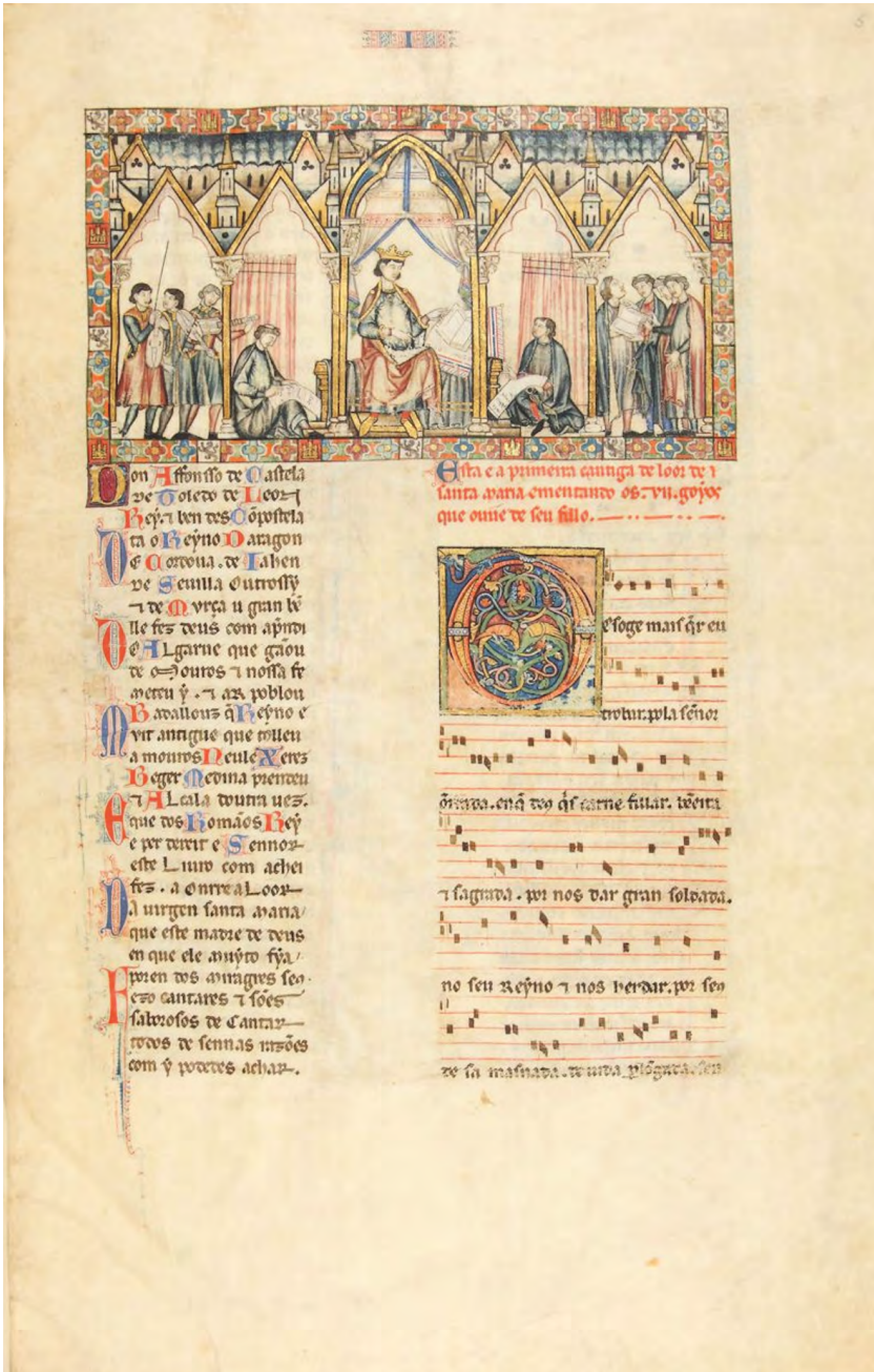
Alfonso X composes his songs of the Virgin in the illustration for the first Cantiga de Santa Maria , ca. 1280–1284, illuminated manuscript; parchment, natural pigments, gold leaf and brushed gold, 40.4 x 27.4 cm, fol. 5r. El Escorial: Real Bibliotheca del Monasterio de El Escorial (inv.-no.: RBMEcat T-1-1)