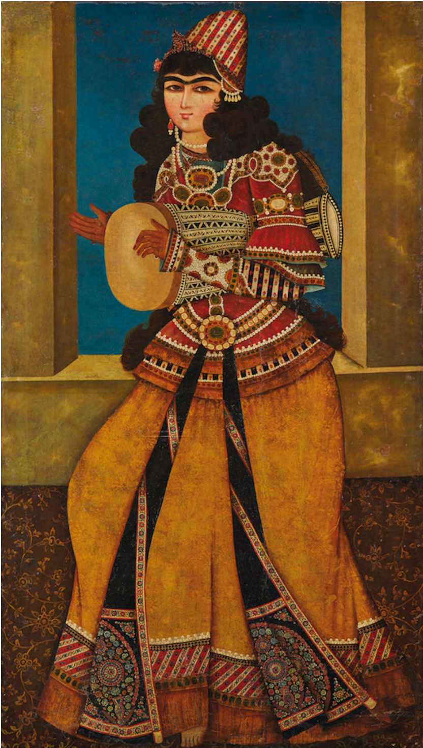
Unknown artist, Dancer with a Tambourine, Iran (Qajar Era) , first part of 19 th century, oil on canvas, 155.0 x 87.0cm. Tbilis: Shalva Amiranashvili State Museum of Fine Arts, Georgian National Museum (inv.-no. 859)