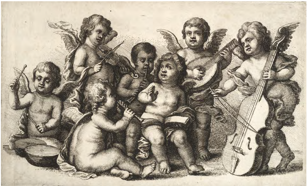
Fig. 2: Wenceslaus Hollar (1607–1677), Concert of the cherubs on earth , 1645, engraving, 13.0 x 21.0 cm. University of Toronto, The Thomas Fisher Rare Book Library, Hollar Collection (call no.: Wenceslaus Hollar Collection, Box 7, folder 17).