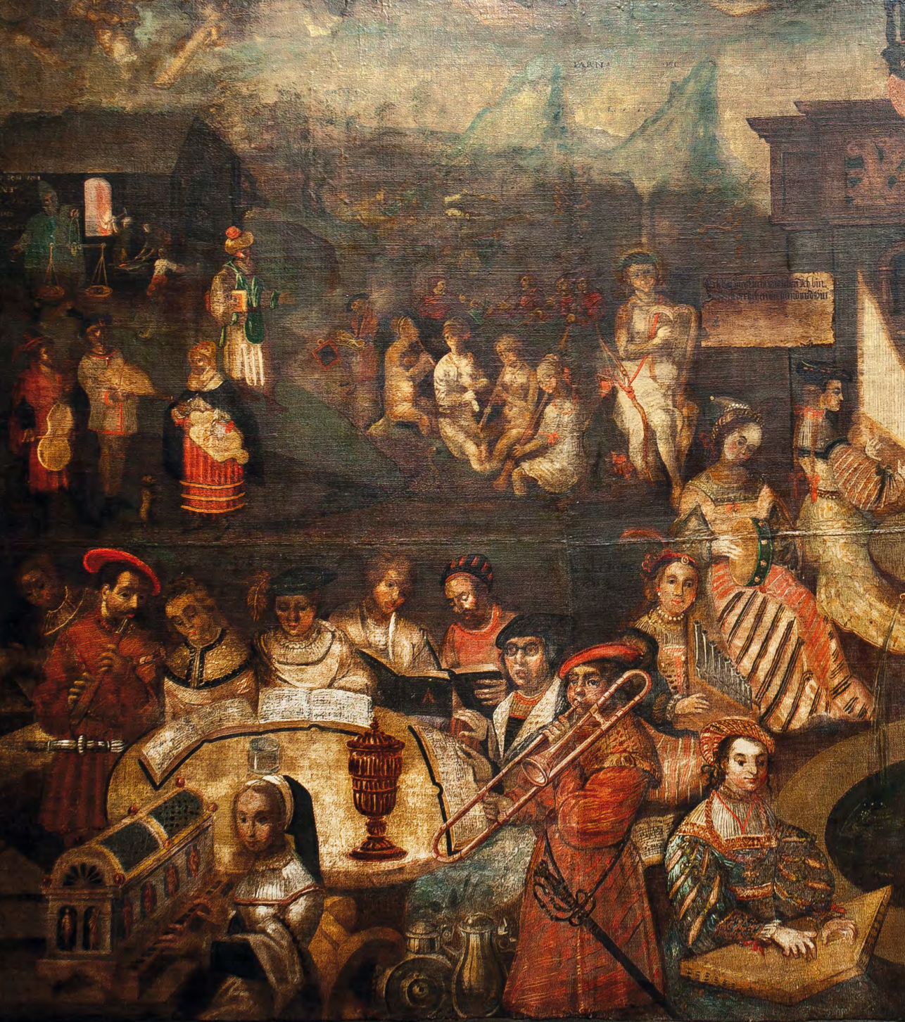
Unknown artist, Kastalischer Brunnen (Castalian Spring) , early 16 th century, oil on wood. Basel: Musikmuseum (inv.-no. 194)