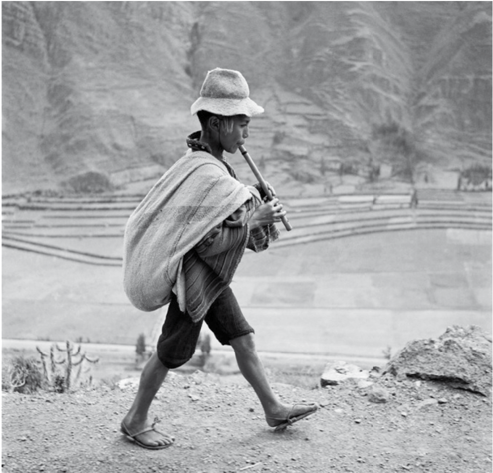
Werner Bischof (1916–1954), On the Way to Cuzco, Peru , 1954, gelatin silver print, 46.99 x 37.15 cm (image). Minneapolis: Minneapolis Institute of Art (inv.-no.: 2007.35.343)