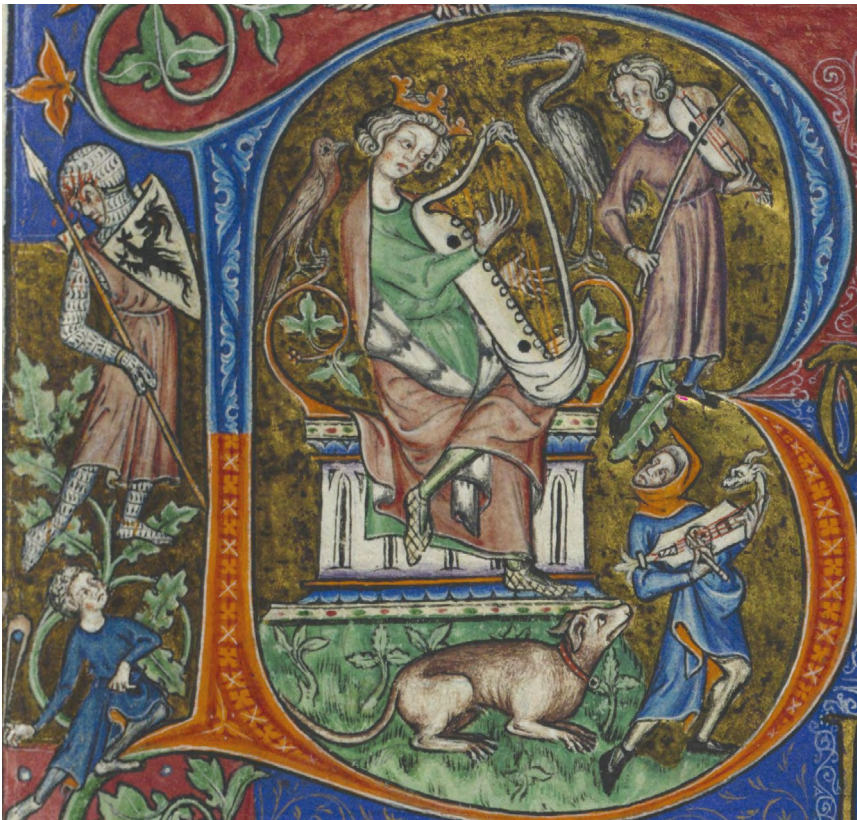
King David, The Peterborough Psalter , fol. 14r, England, 1300–1325. Brussels: Royal Library of Belgium, MS 9961–62