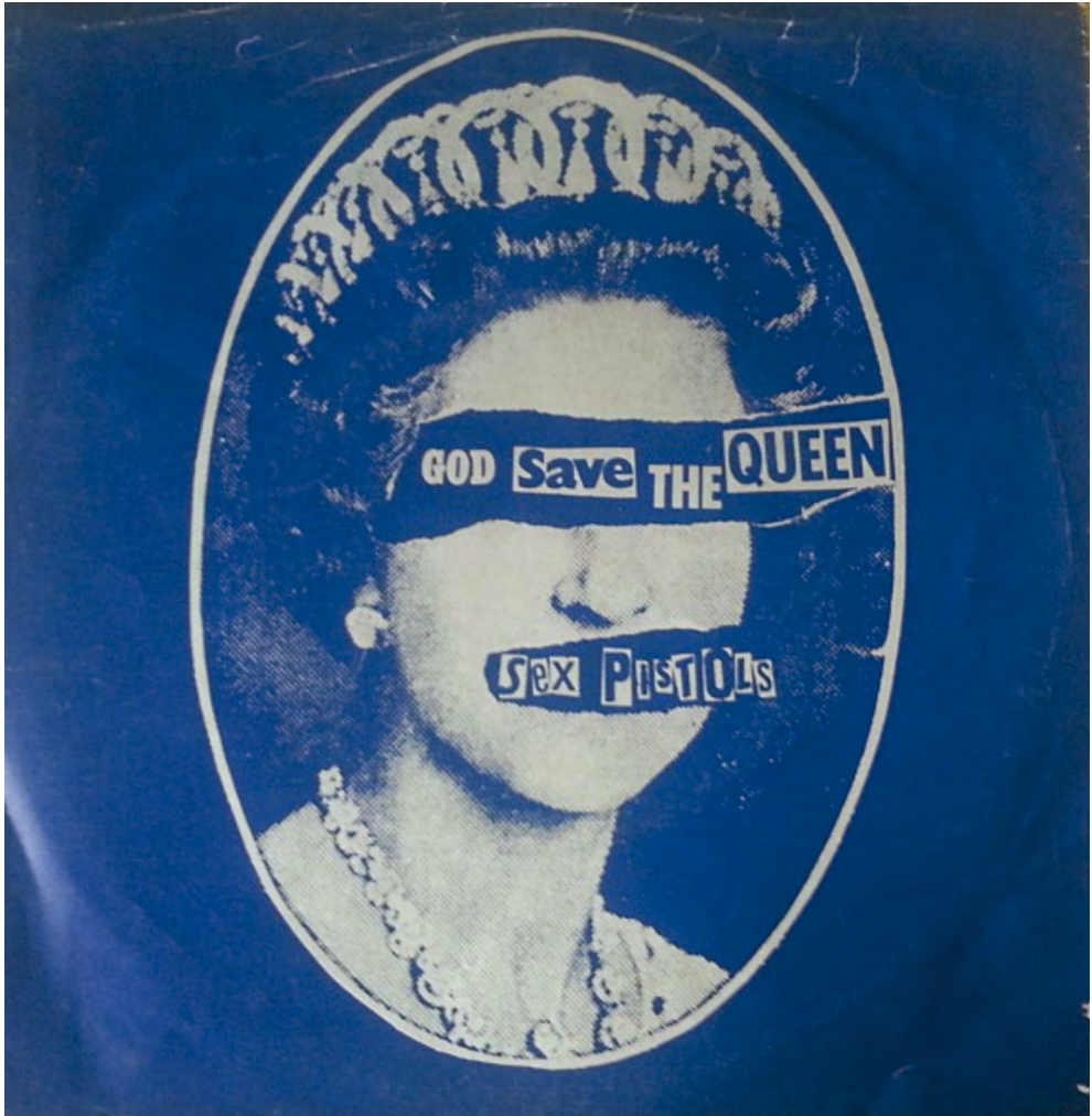
Cover by Jamie Reid of the single God Save The Queen by the Sex Pistols, released 27 May 1977, Virgin 11308 AT, vinyl, 7", 45 RPM, stereo; Tracks A: God Save The Queen (3:20), B: Did You No Wrong (3:09)