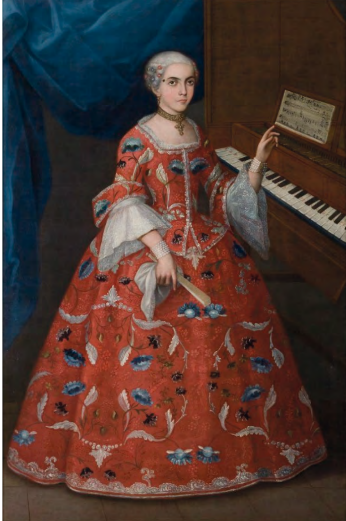
Unknown Mexican painter, Mujer Joven con Clavicémbalo , 1735–1750, oil on canvas, 183.52 x 129.23 cm (framed). Denver: Denver Art Museum (inv.-no.: 2014.209)