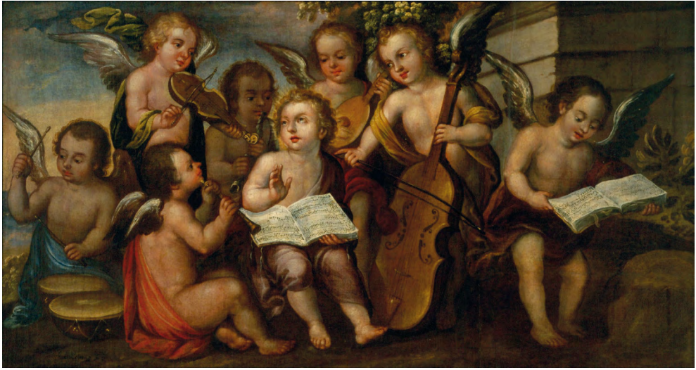
Fig. 1: Juan Correa (ca. 1646–1739), El Niño Jesús con ángeles músicos , early 18 th century, oil on canvas, 143.5 x 76 cm. México: Museo Nacional de Arte (inv.-no.: 17645).