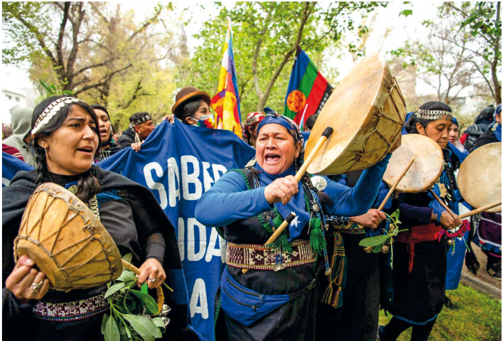
Mapuche Indigenous people protest in Santiago in October 2021

Association Répertoire International d'Iconographie Musicale Badergasse 9, CH-8001 Zurich association@ridim.org www.ridim.org