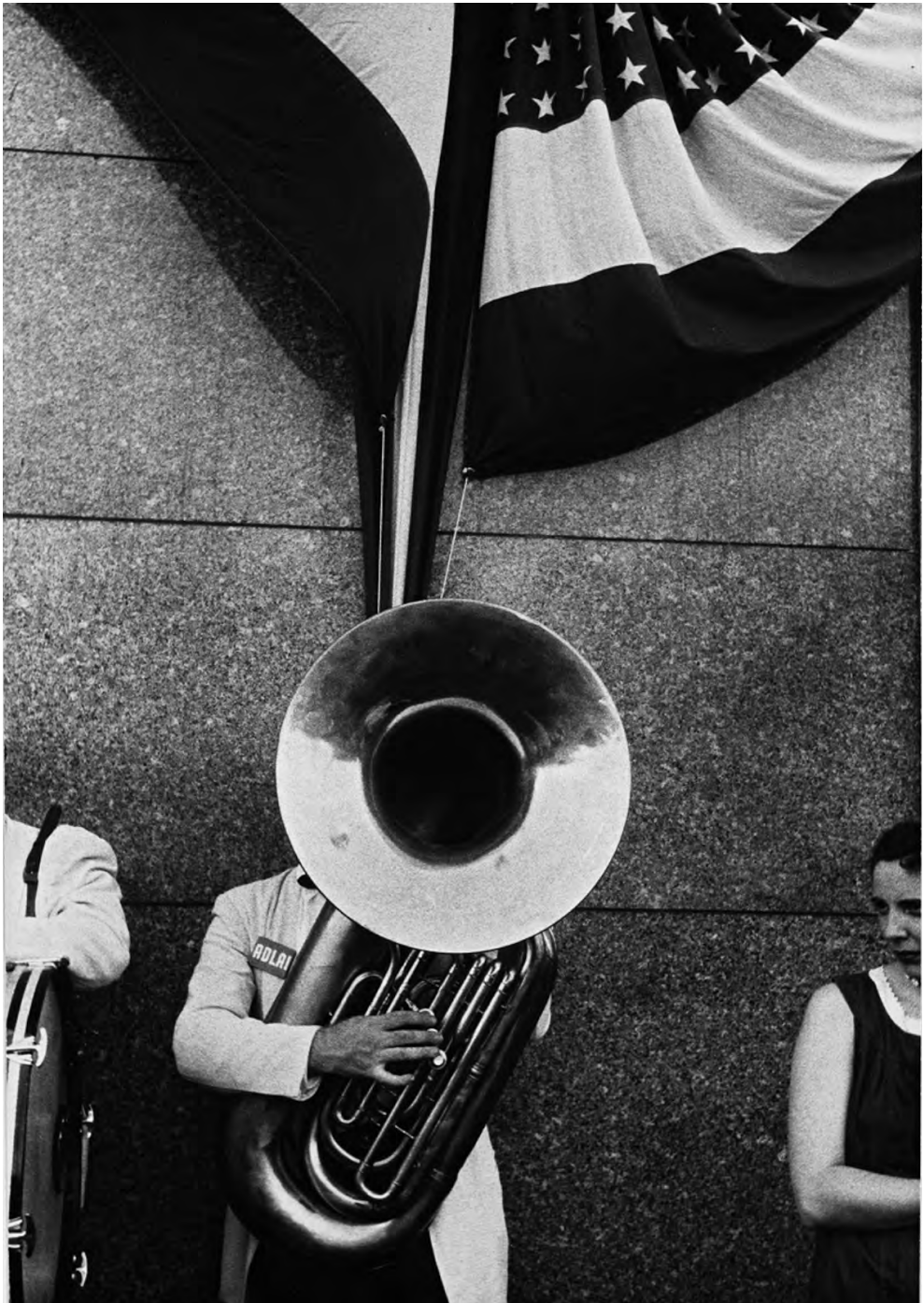
Robert Frank (1924-2019), Political Rally, Chicago , 1956, gelatin silver print, 34.1 x 23.3 cm (image). Chicago: Art Chicago Institute (inv.-no. 1961.948).