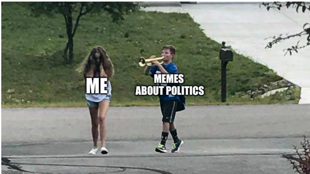
Meme "Trumpet Boy", Author Unknown