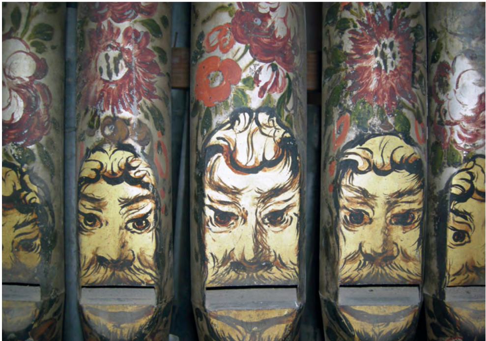
Mascaroons on the principals of pipe organs of San Andrés Zautla's, San Jerónimo Tlacoahuaya's and San Pedro Quiatoni's.

Graduate in restoration from the National School of Conservation, Restoration and Museography (ENCRyM) of the National Institute of Anthropology and History (INAH) and master in art: decoding and analysis of the visual image from the Hellenic Cultural Institute. She is currently a PhD student in art from the National Institute of Fine Arts (INBAL). Since 2015 she is professor-researcher responsible for Conservation Laboratory of Musical Instruments at the ENCRyM. She has collaborated with seven Mexican museums and institutions in the conservation and cataloging of musical instruments, among them the National Museum of Anthropology, National Museum of History and the INAH Sound Library. From 2014 to 2018 she was head of the Seminar on the Study of Historical Organs in Mexico (SEOHM)- INAH and is co-author of the book ¿Cómo inventariar un órgano histórico? (2018). Her main line of research is the construction techniques and conservation of novohispanic pipe organs.